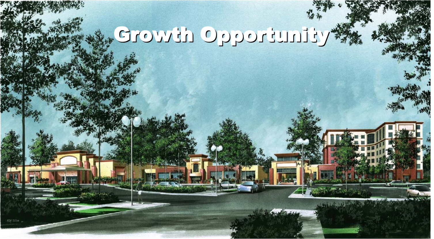
Deerfoot Inn & Casino